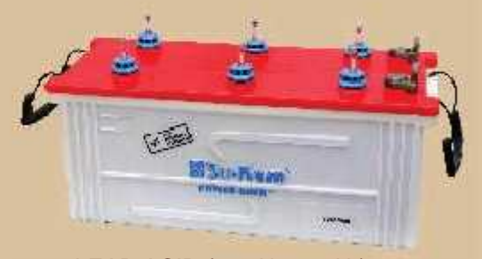
LEAD ACID (100Ah-200Ah)